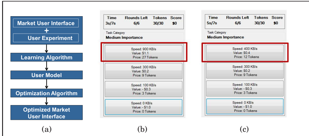
Fig. 4. (a) Market UI Optimization Method. (b) A sample UI optimized assuming perfectly rational play. (c) A sample UI optimized assuming behavioral play.

Then we solved the resulting MDP, where now Q-values are computed assuming that the user will follow the “behavioral strategy” when playing the game. Finally, we selected the UI with the highest expected value according to this “behavioral MDP.” Figure 4 (a) shows a diagram illustrating our market UI optimization methodology.