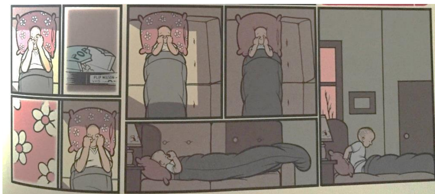
Fig. 3. Chris Ware, Jimmy Corrigan, The Smartest Kid on Earth , Pantheon Books, 29 Apr. 2003.

As I continued to “sharpen the axe” and develop Reasons for Returning , I found myself getting reacquainted with the work of the American cartoonist Chris Ware. Ware is a draftsman par excellence. Every line is considered. Every colour and angle carefully chosen to help tell his stories and invite the reader into his worlds. He approaches his work like the best set designers, using everything at his disposal and wasting nothing. In Ware’s work, the silences and atmosphere are just as important as text, and he uses the visuals, by bending reality, to show us the inner emotions of the characters. Take fig. 3, for example, from his award-winning graphic novel Jimmy Corrigan, The Smartest Kid on Earth .