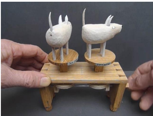
Fig. 1. Screenshot from “2 Dogs That Meet on a Regular Basis.”

crank and the dogs start to spin. They move at different speeds and at different times, stopping occasionally. At one time the dogs are facing away from each other (see fig. 1). A moment later one dog smells the other dog. And every once in a while, the dogs face each other (see fig. 2). When this happens, the hand pauses, allowing the two dogs a moment to see themselves, before starting the crank again. This small automaton, titled “2 Dogs That Meet on a Regular Basis”, built by Paul Spooner as part of the Cabaret Mechanical Theatre founded by Sue Jackson, is an example of the simplest of storytelling (Cabaret). Two characters, in this case the dogs, meet and interact. There is no dialogue. No actors. No lights, sound, or costumes.