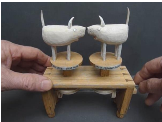
Fig. 2. Screenshot from “2 Dogs That Meet on a Regular Basis.”