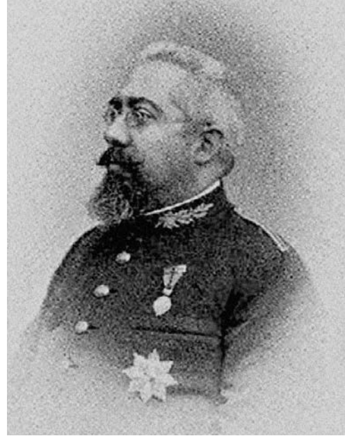
Figure 2: A portrait of Dr. Félix Estrada Catoyra