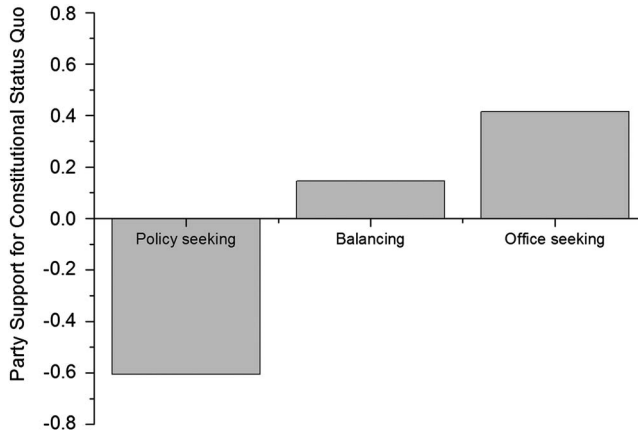
Figure 1 Party support for constitutional status quo and party goals in 15 established democracies.