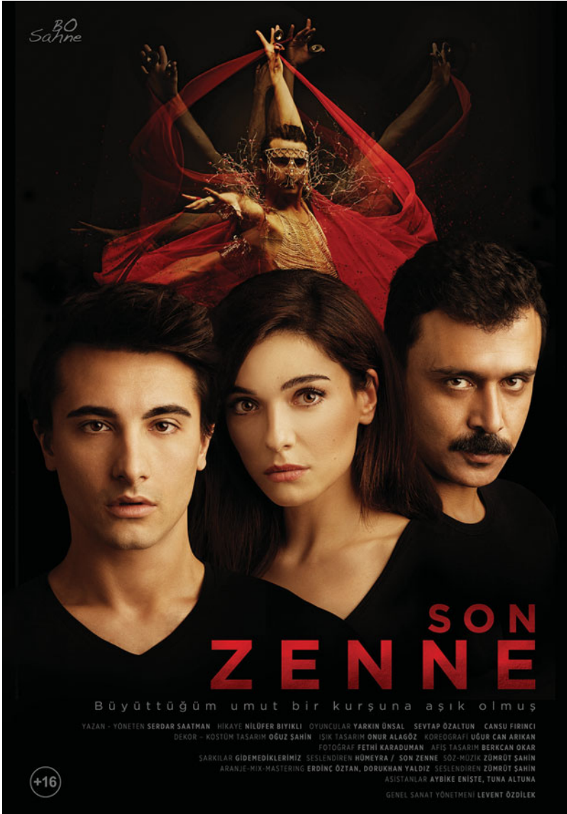
FIG. 4 (Colour online) Promotional poster for Son Zenne . Photo: Fethi Karaduman. Graphic Design: Berkcan Okar.

a cross-over figure, the zenne has even entered more mainstream media contexts, such as on the Turkish version of the US reality television franchise So You Think You Can Dance? ( Dans Eder Misin? ), which ran from 2007 to 2012. Zenne dancers became an audience favourite on the show, attesting to the growing interest in this performance tradition in Turkish pop culture.