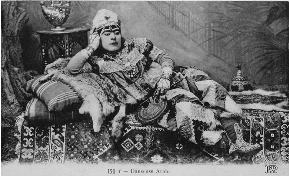
FIG. 1 Postcard of an Ottoman köçek dancer, nineteenth century.

displayed female body as the emblem of modern attitudes towards sex and gender, the köçek fell out of popularity and the belly dancing woman took his place in the modern Turkish republic.