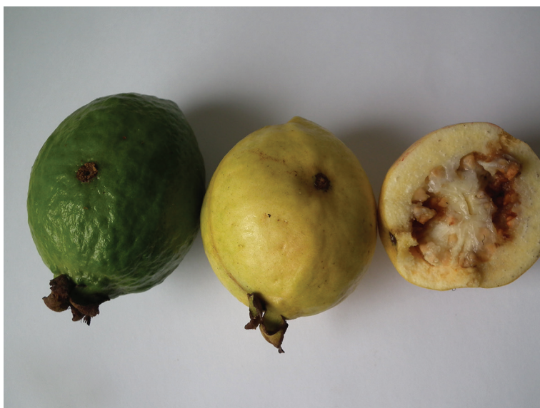
Figure 5. Damaged fruits by Conotrachelus dimidiatus .