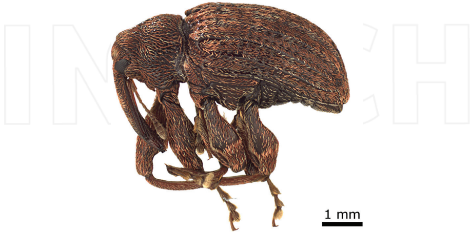
Figure 3. Conotrachelus perseae , small avocado seed weevil.

sides. The mesothorax has two pairs of setae located within a lobe and in the middle part is the other rounded lobe. Abdominal segments are characterized by two pairs of setae in the ventral part of each segment; the eighth and ninth segments present a pair of lateral setae [12]. Adults ( Figure 3 ) are dark brown; prothorax, in dorsal view, is strongly constrained in the apical portion [3, 13–15]. Humeral region of the elytra of C. perseae is wider than the base of prothorax.