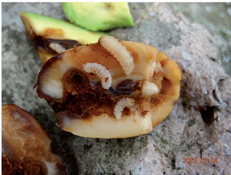
Figure 2. Damages in fruits by Heilipus lauri , big seed borer avocado.

Females drill and lay eggs directly in growing fruits ( Figure 2 ) causing its injury inside; once the larvae emerge, they feed through the pulp to reach the seed where it completes its life cycle. When heavy infestations are recorded and no management is used, infestations of larvae can damage up to 67% of the fruits; in orchards with management of the pest, it has been quantified losses of 3% [9].