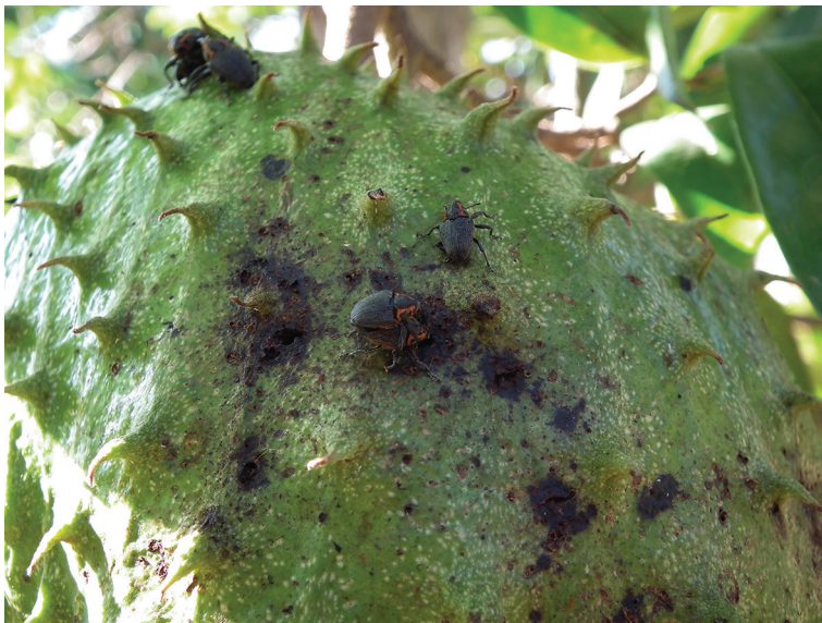
Figure 7. Damaged fruits of soursop by Optatus palmaris .

Optatus palmaris causes damage in chirimoya ( Annona cherimola ) [41, 42]; it has also been found in soursop, Annona muricata L. and ilama ( Annona diversifolia L.). The larvae feed on the pulp and seeds of the fruit; in the final of the larval stage, it leaves the fruit and pupae in the soil [42]. Adults make holes in the fruits of soursop and chirimoya when they are feeding (Figure 7) or lay eggs (Figure 8); when there are no developed fruits, they feed on the petals and pedicel of small fruit, causing its fall. Damage of the species of the genus Optatus in A. cherimola corresponds to a pattern of drawings, similar to the letters "C" or "O," which is a group of holes caused by adults when they feed; in places where the larvae feed, first necroses and slight watery discharge are observed; feeding causes a small hole deepens to seed; when moves from the fruit, it leaves a hole of 2–3 mm in diameter [42]. In soursop, O. palmaris adults can damage 38% of the total area of the fruit and it is possible to find an average of six larvae per fruit. The fruits most affected are those close to the harvest [34].