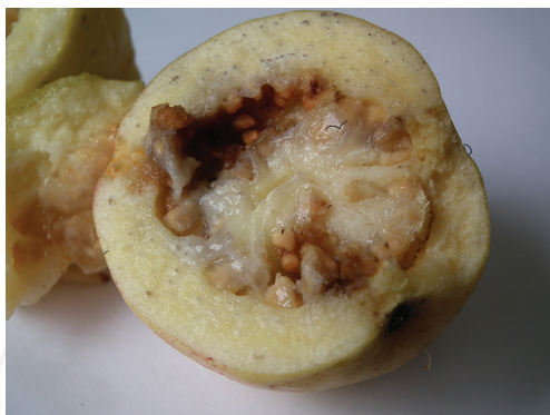
Figure 6. Damaged fruits by larvae of Conotrachelus dimidiatus . Note the blackening of the pulp.