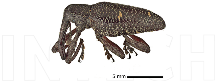
Figure 1. Male of Heilipus lauri , big seed borer of avocado.

irregular enlarged spots, formed by copactation of small opaque orange oval scales. The first pair is the biggest and it is located 2/5 at the base of the elytra and the second one, 1/5 of the apice, located almost over the periapical callus [4].