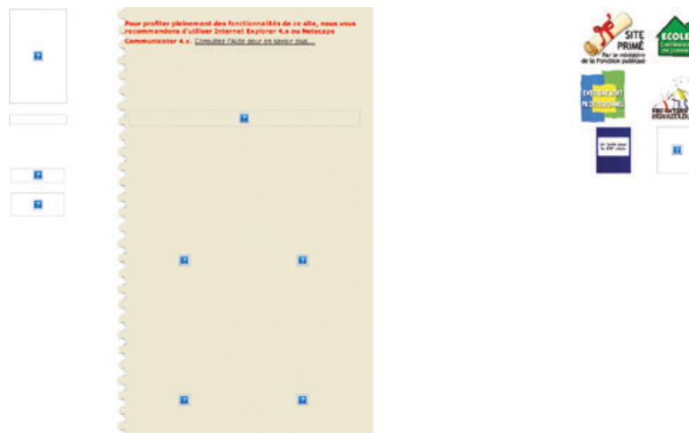
Figure 6.5 Page from the Strasbourg Board of Education website, archived by Internet Archive on 17 August 2000 http://web.archive.org/web/20000817041856/ http://www.ac-strasbourg.fr/ Last accessed on 24 July 2015