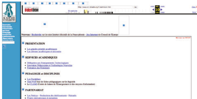
Figure 6.3 Homepage from the Strasbourg Board of Education website, archived by Internet Archive on 10 December 1997 http://web.archive.org/web/19971210212812/ http://www.ac-strasbourg.fr/ Last accessed on 24 July 2015