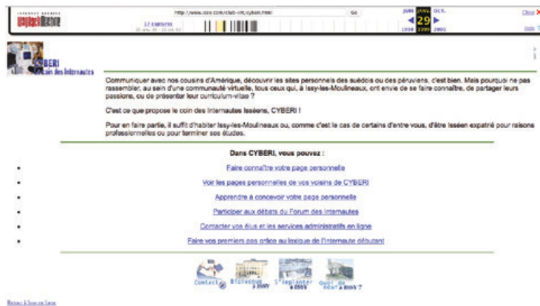
Figure 6.1 Internet Archive. (1999). Cyberi Homepage. Issy-les-Moulineaux. Archived on 29 January 1999 http://web.archive.org/web/19990129025023/http://www.issy.com/club-int/cyberi.html Last accessed on 2 December 2015

government was still needed: Lionel Jospin’s speech in Hourtin offered that cue.