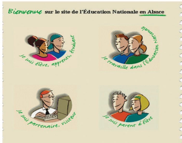
Figure 6.4 Homepage for the Strasbourg Board of Education, displaying links to one access page for each category of visitor (DIRE, 2001)

Access to the 2000 website, successor to the two previous versions, is not possible any more through the Wayback Machine; fortunately the DIRE report gives us an idea of its design (Figures 6.4 and 6.5) – while giving additional confirmation that it is necessary for historians to cross-reference web archives with other sources.