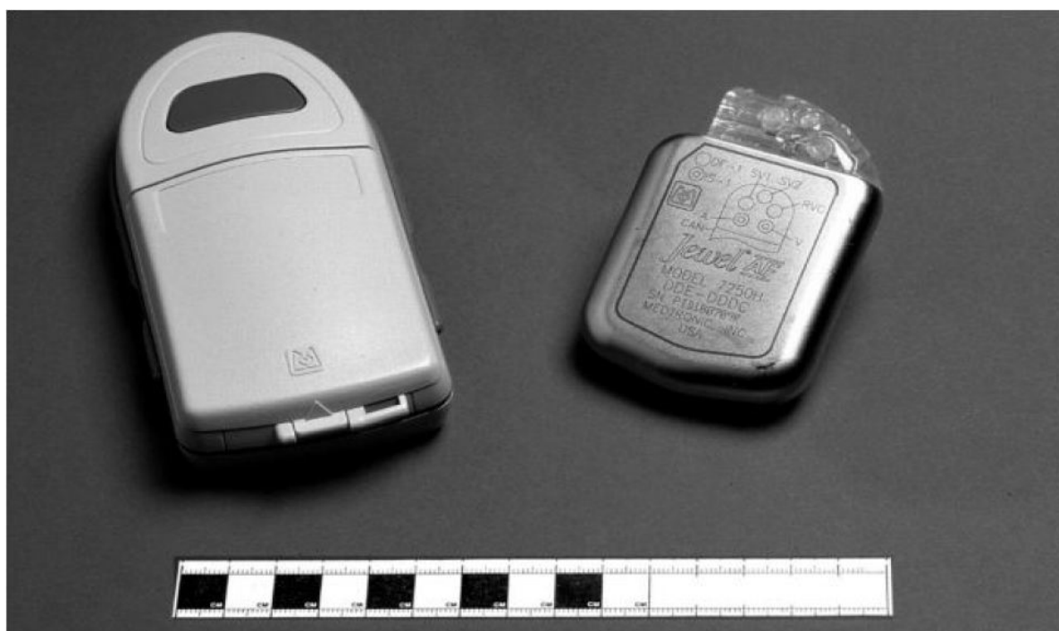
Figure 1: Medtronic Jewel AF Atrial Defibrillator and Patient Activator 32 (with Permission)

While electrical cardioversion of atrial fibrillation is usually performed by applying energy across the