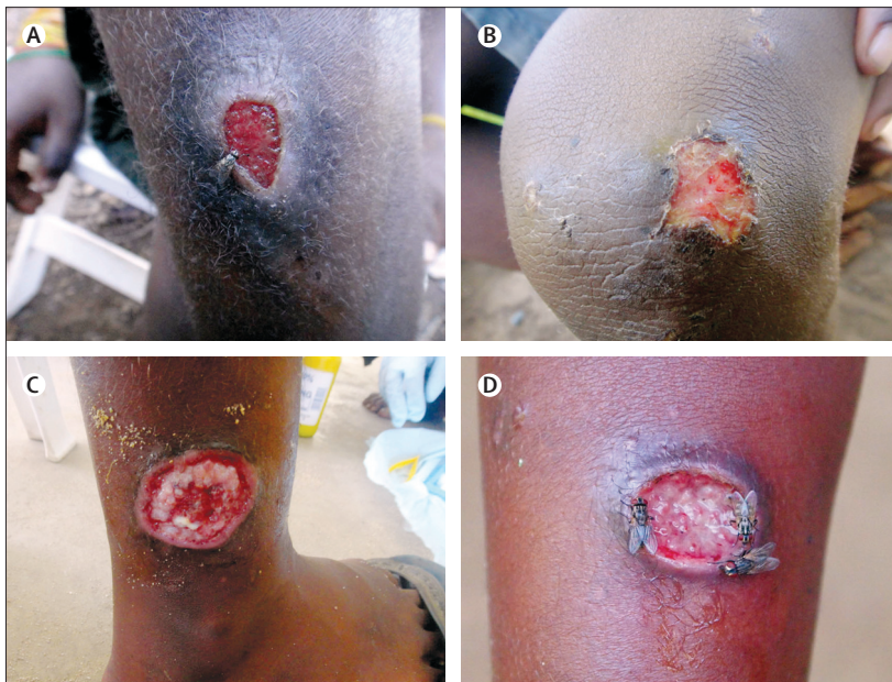
Figure 3: Appearance of leg ulcers in children from Lihir Island (A, B) Shallow, slough-base ulcers with rolling edges in patients with Haemophilus ducreyi infection. (C, D) Red, moist, hypergranulating ulcers with raised edges on the legs of patients with primary yaws.

access to all the data in the study and had final responsibility for the decision to submit for publication.