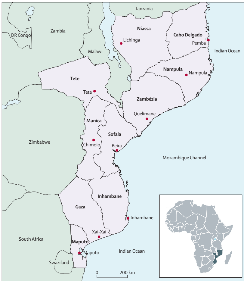
Figure 1: Political map of provinces and provincial capital cities of Mozambique

disorders (6%), malaria (6%), hypoxia and asphyxia (6%), and pneumonia (4%). 4 The Mozambican National Health Service is the primary provider of formal health services in the country, with more than 90% of the population outside of the capital city of Maputo seeking care from public-sector clinics. However, the system is understaffed and underfunded relative to the high burden of infectious and chronic diseases. Over the past decade, health-systems strengthening has been an important focus of efforts to achieve MDG 4, with particular attention paid to the role of human resources for health and the availability, access, and quality of safe delivery services. 5 Several studies have examined the relation between health-system factors and under-5 mortality in low-income and middle-income countries, but few to none (to our knowledge) have used longitudinal designs with data resolutions below the national level. 6–10