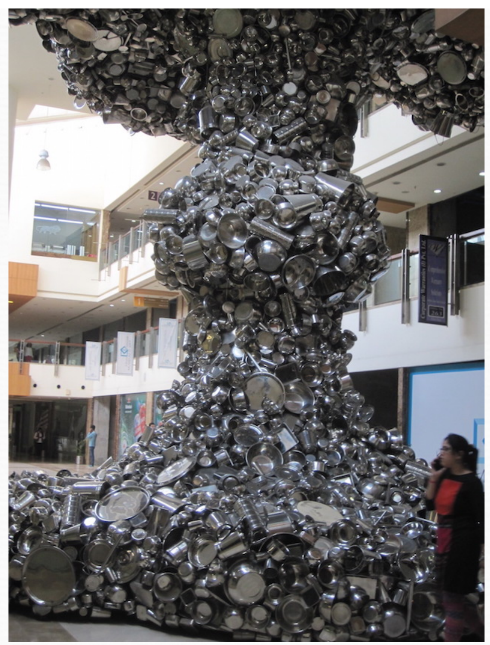
Subodh Gupta, Lines of Control, 2008