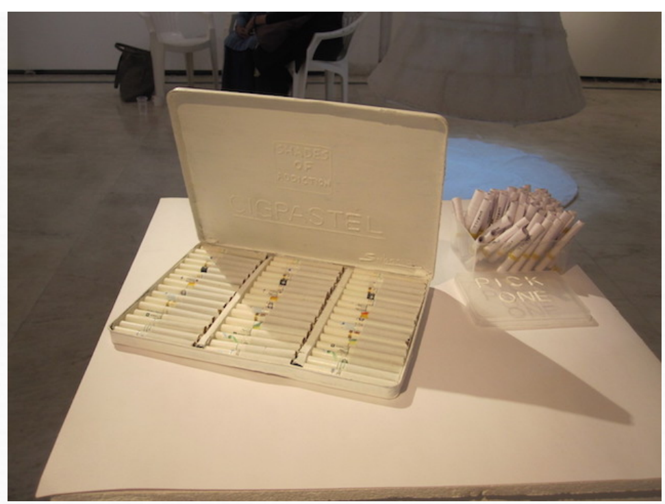
Sukanya Garg, Untitled (2016) and Shades of Addiction (2016)