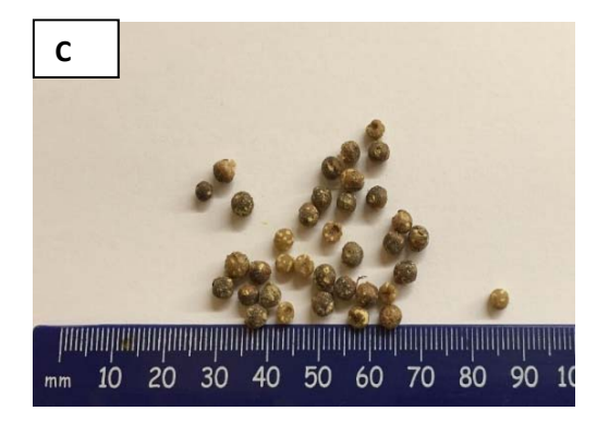
Figure 1a, b and c. Photographs showing R. melanophloeos fresh fruits (A) dry ripe fruits (B) and seeds with fruit pulp removed (C).