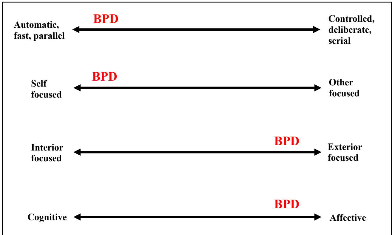
Figure 2. Mentalizing Profile of Borderline Personality Disorder Across the Four Polarities that Underlie Mentalizing.