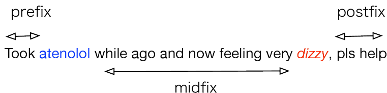
Figure 2: Extracting lexical patterns from a tweet that describe the an adverse reaction (dizziness) caused by a drug (Atenolol). The tweet is split into three parts, prefix , midfix , and postfix , and various lexical patterns are extracted from each part. See text for the details of the pattern extraction method. Best viewed in colour.

twitter user has indeed taken this drug and not simply reporting an adverse reaction experienced by a different person. Such information is useful to estimate the reliability of the relationships mentioned in social media, which can often be noisy and unreliable. Therefore, in this work, we use all prefix, midfix, and postfix sections in tweets for extracting lexical patterns. We experimentally evaluate the significance of prefix, midfix, and postfix for ADR detection later in Section Error! Reference source not found..