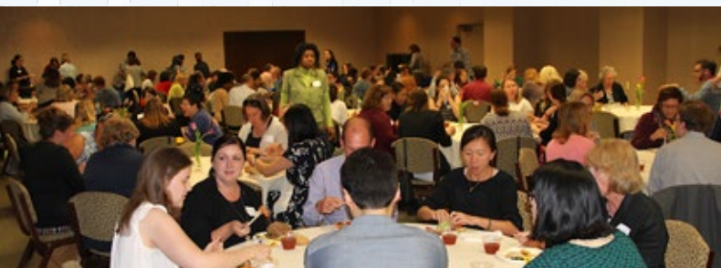
Participants enjoy lunch on the second day of the symposium.