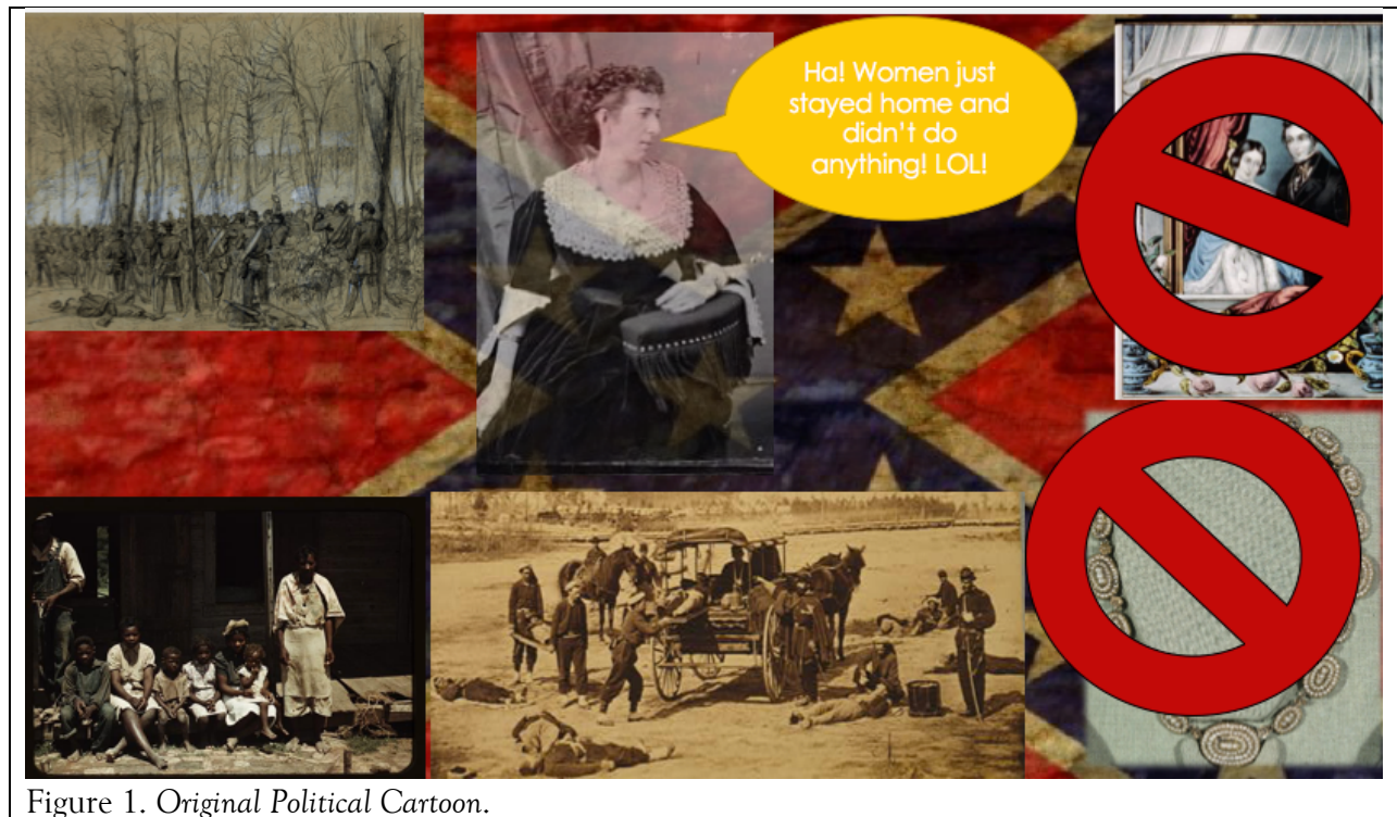
Figure 1. Original Political Cartoon.

Students' OPCs represent creative expressions of newly generative understandings. To distinguish students' intent and effort, teachers can require students to detail in writing the messages encoded through symbolism and integration of text and visual imagery. It would perhaps be problematic to grade students' creativity, the complexity of their creative expression, or the novelty of their creativity; contemporary education initiatives, however, prescribe text-based writing. Teachers should instead assess students' critical and historical thinking through the historical argumentation emergent within document-based writing. Figure Two, Document-Based Writing , is an illustrative example of one 8 th grade student's historical argumentation; it corresponds directly with Figure One, Original Political Cartoon .