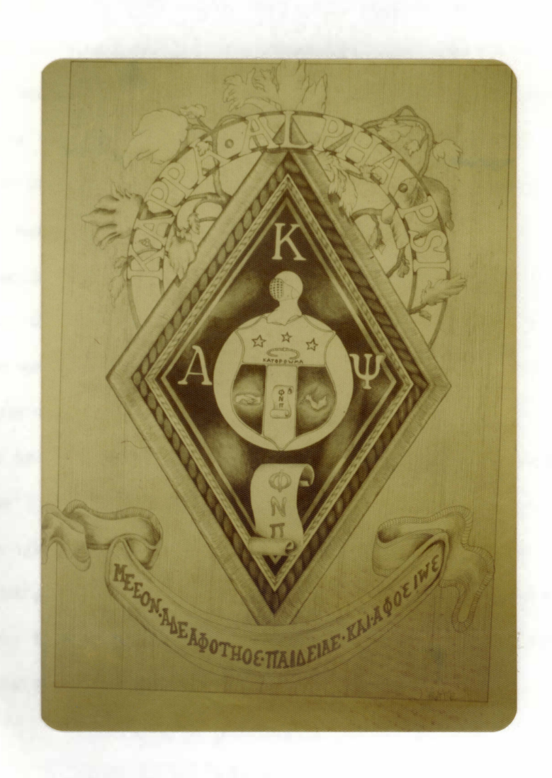
Fig. 9 THE KAPPA EMBLEM