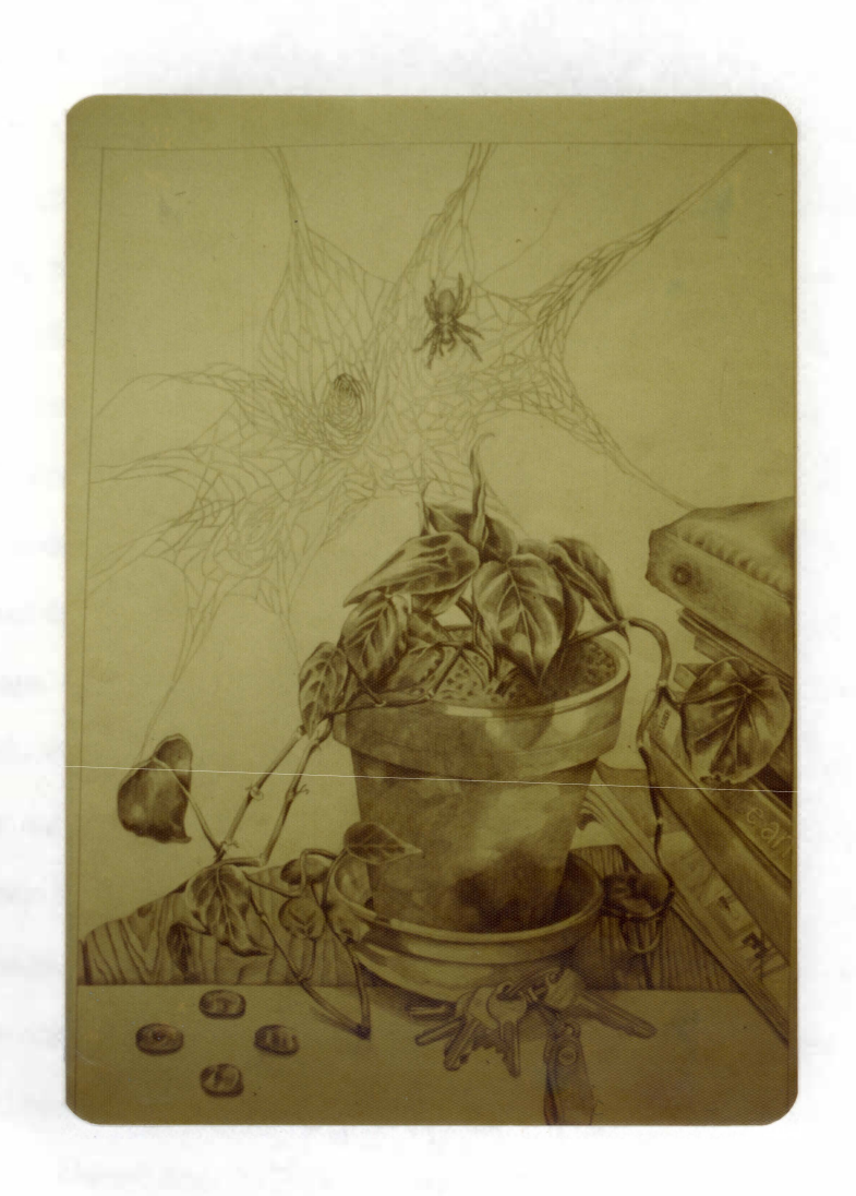
Fig. 12 A MATTER OF TIME