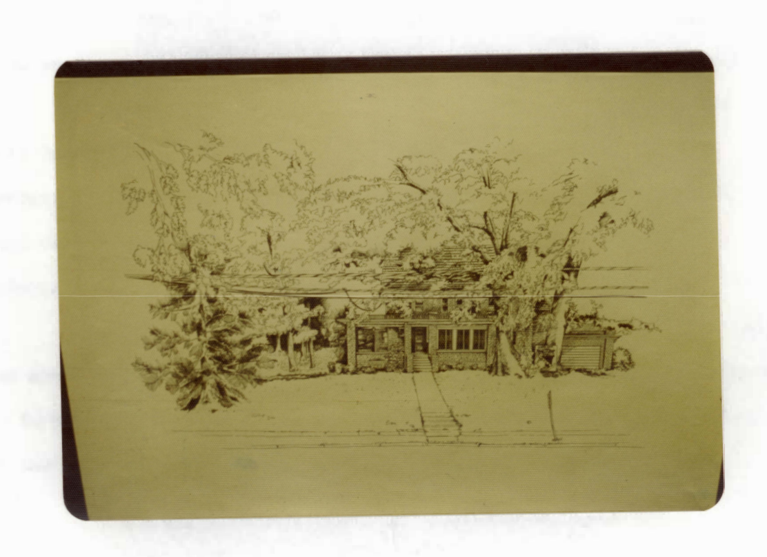
Fig. 17 THE HOUSE ACROSS THE STREET