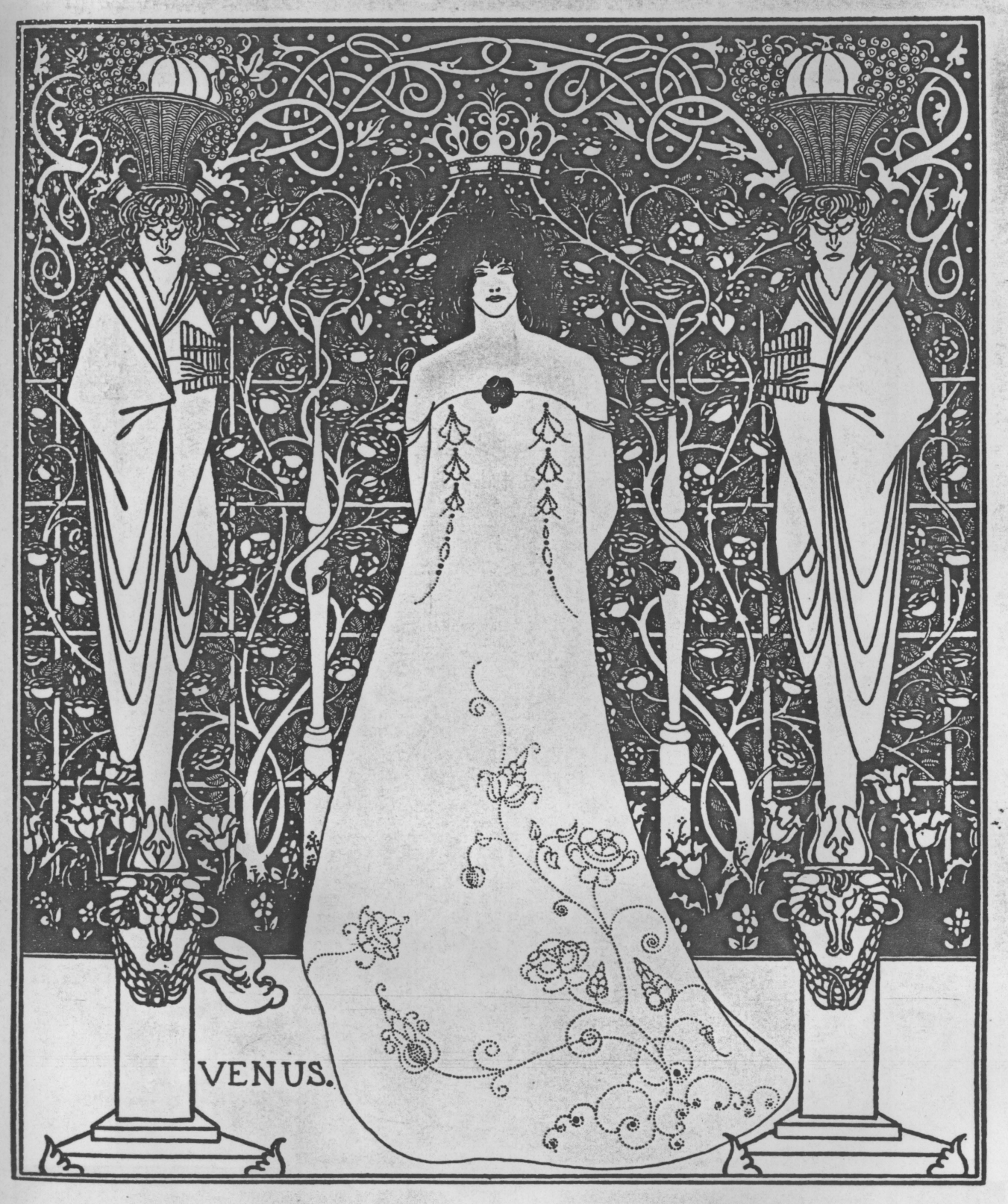
FRONTISPIECE. FOR "VENUS AND TANNHÄUSER" 😂