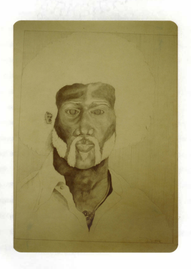
Fig. 10 SELF PORTRAIT