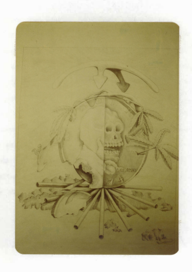
Fig. 13 THE PRICE OF COPPER