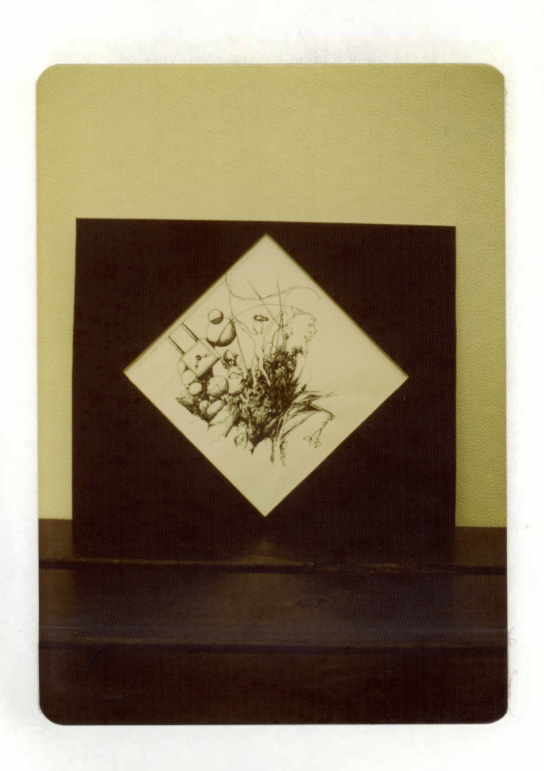
Fig. 5 TIME VERSUS FREEDOM