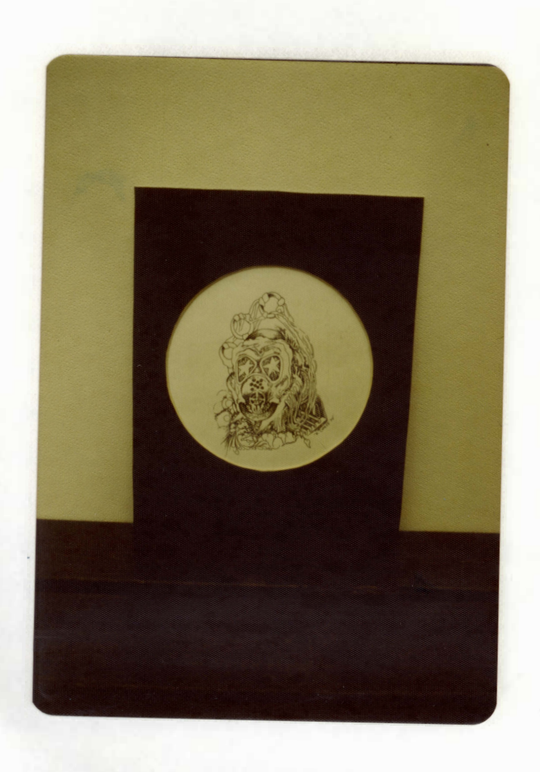
Fig. 6 NATURAL HIGH