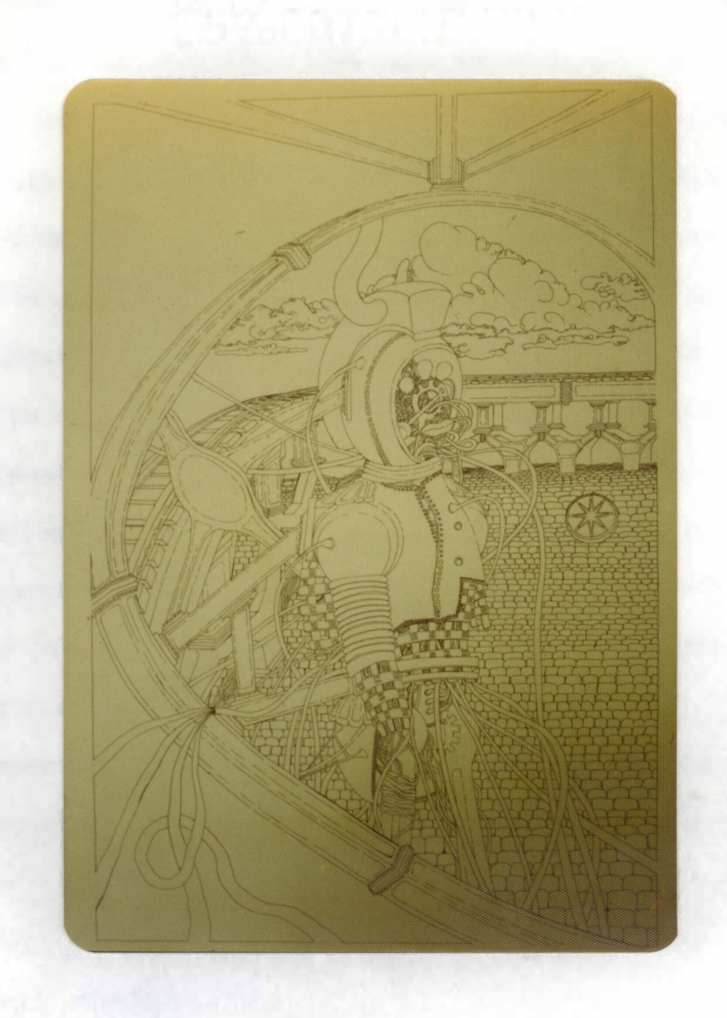
Fig. 19 SYMPHONY OF MANKIND