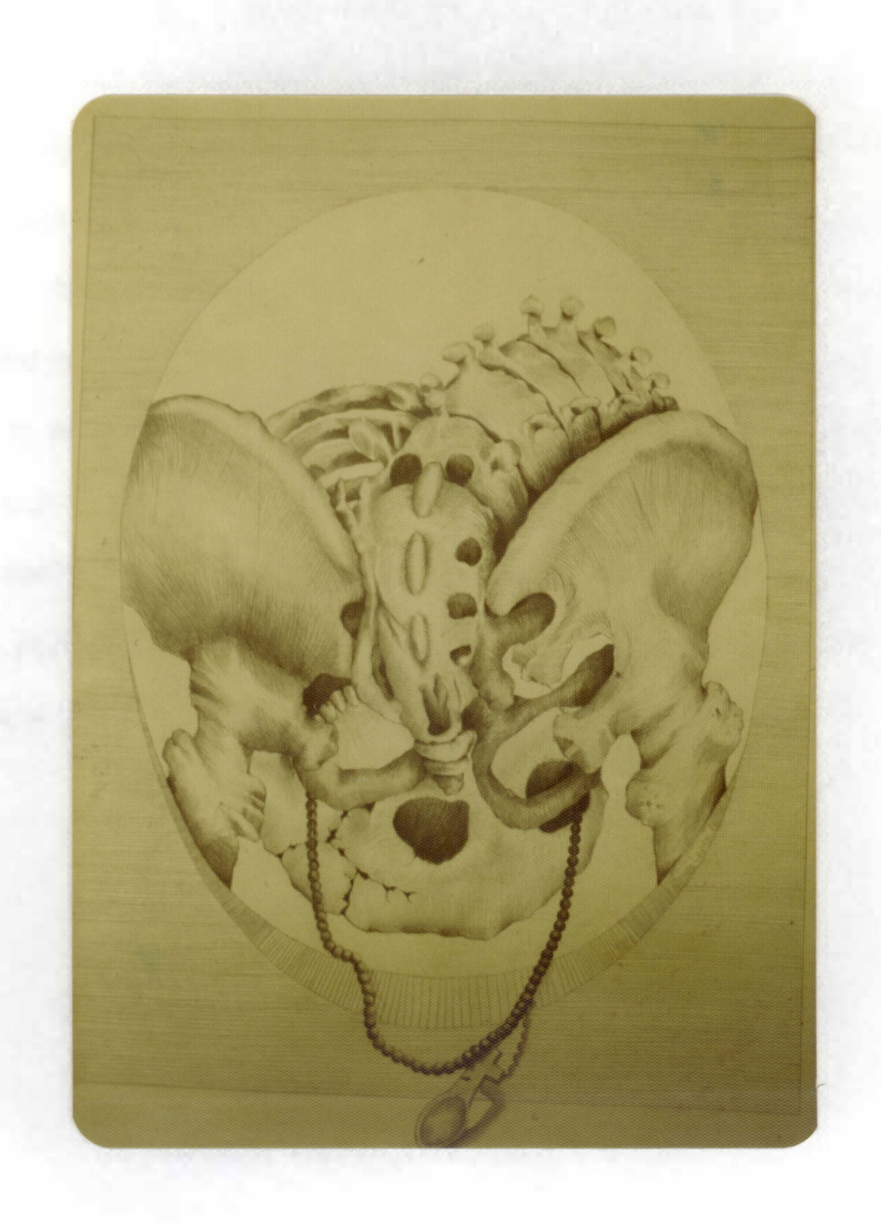
Fig. 15 LOOKING AT YOURSELF