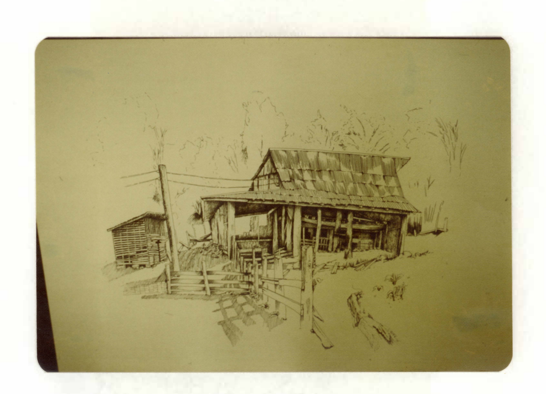
Fig. 4 "THE MAN'S HOME"