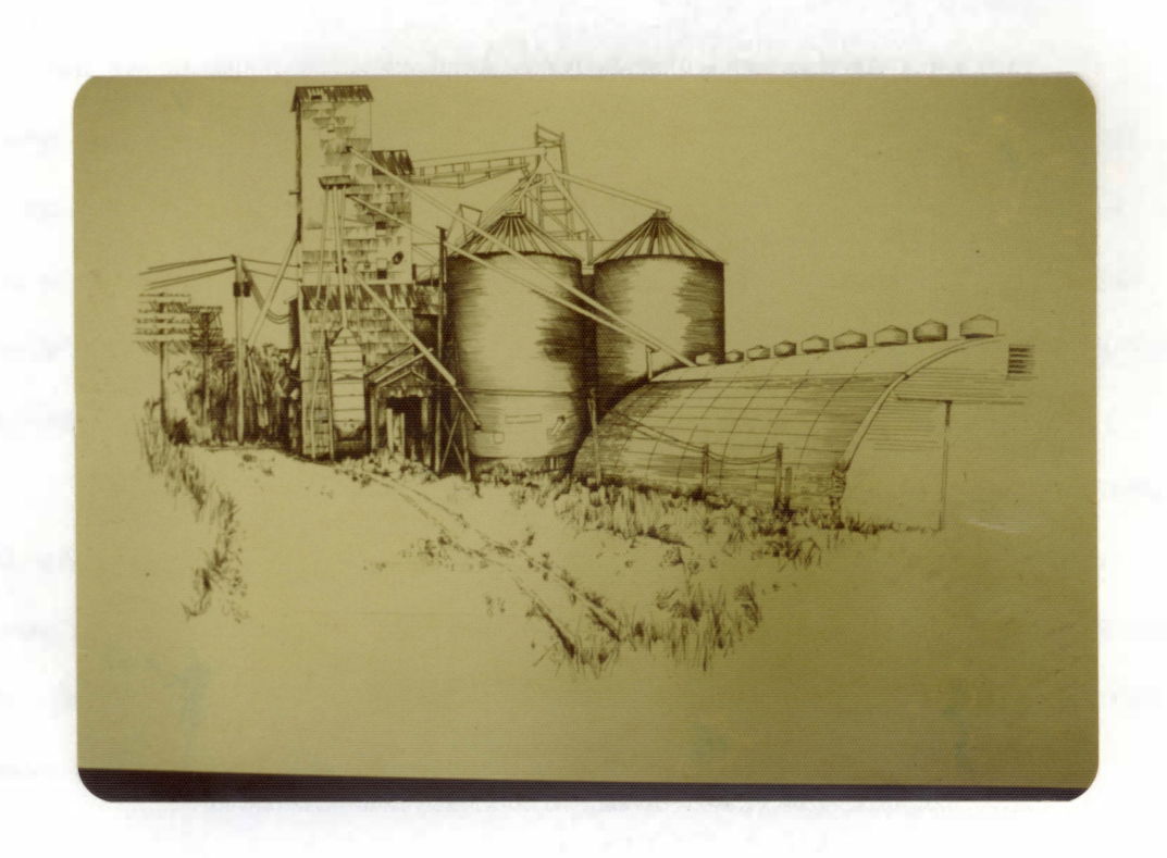
Fig. 14 GRAIN FACTORIES