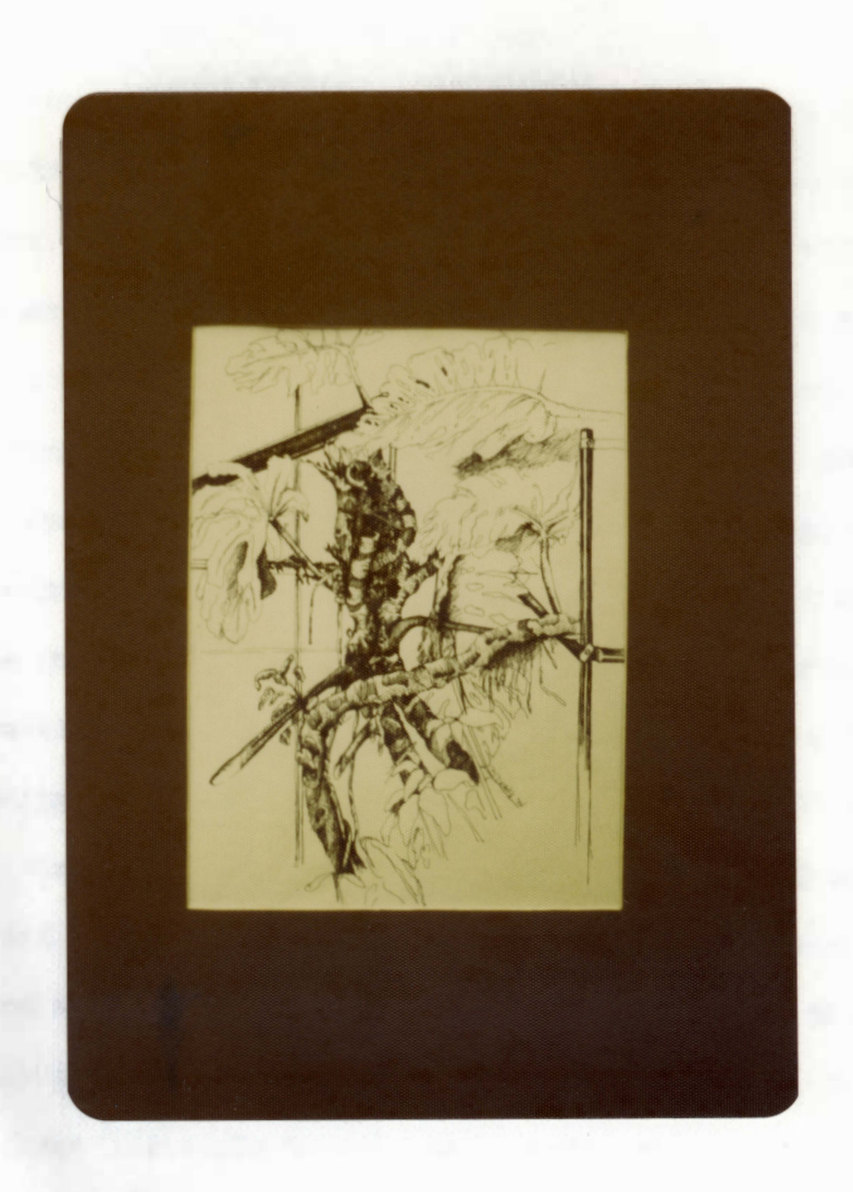
Fig. 7 WORLD OF GROWTH