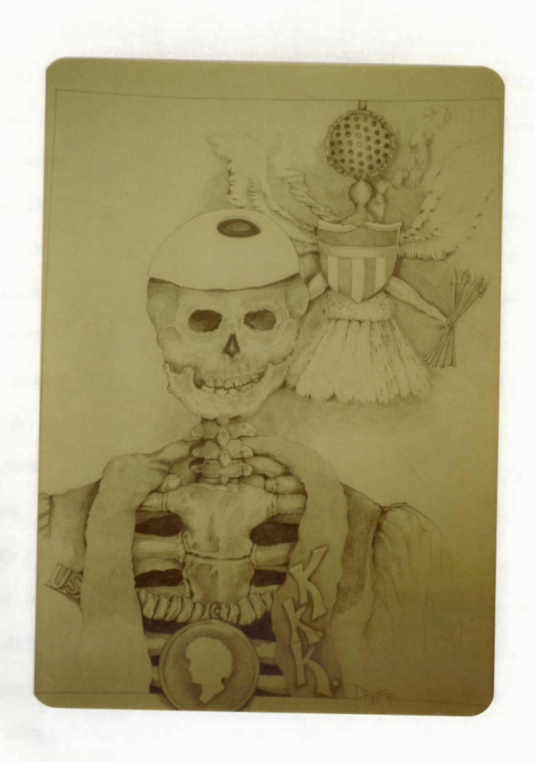
Fig. 8 THE AMERICAN DREAM