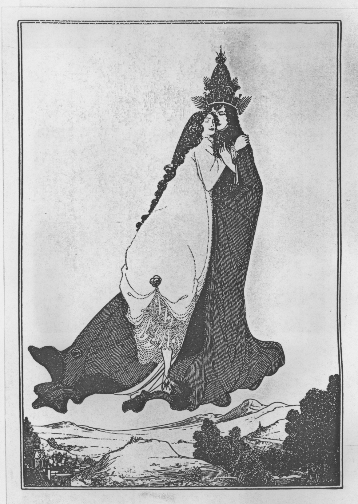
SAINT ROSE OF LIMA