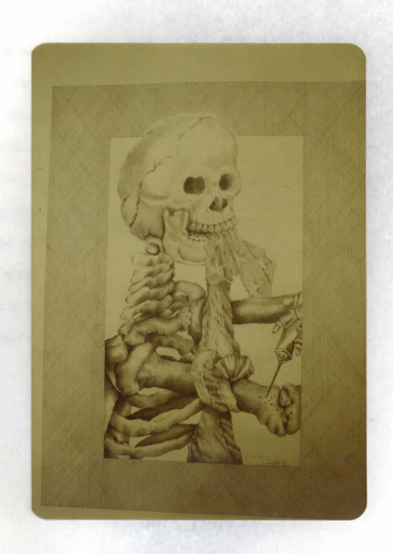
Fig. 18 A SHOT IN THE ARM