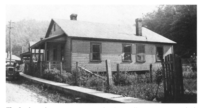
The Quaker volunteers were assigned to this small miner's cottage, which was run-down and without furniture. The Friends were forced to borrow a double bed and rent some cots for their stay.

on an off-duty shooting spree, merely "because he liked it."