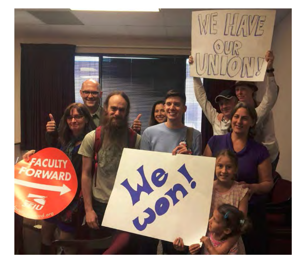
NTT faculty at Duke, after voting to form a union in 2016