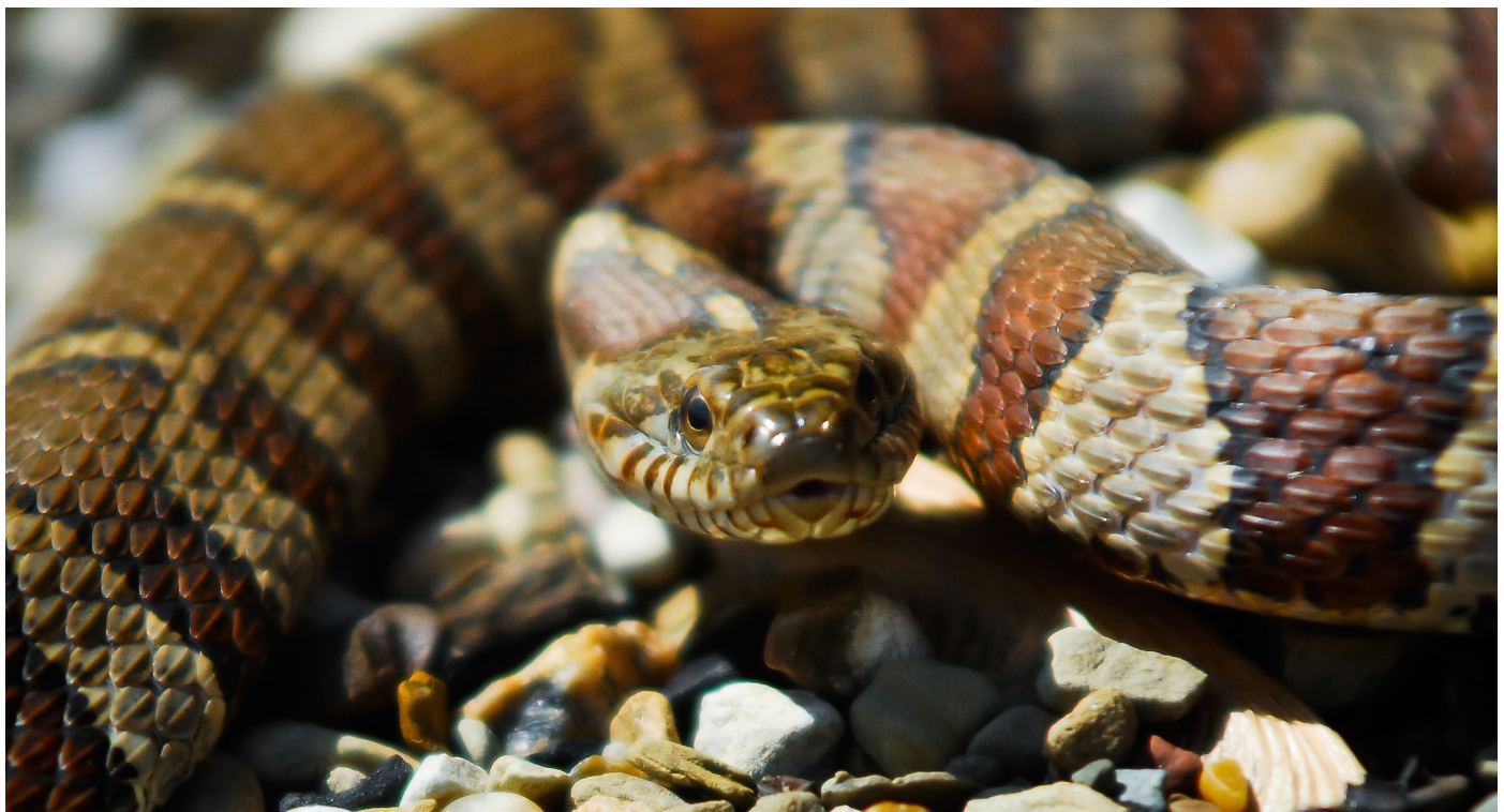
Fig. 1. Adult female Common Watersnake ( Nerodia sipedon ).

Madsen 1984, Reinert 1984, Shine 1987), a technique that is often limited to focal individuals (usually having larger body sizes) over a relatively short time period. Studies of aquatic snakes have emphasized the importance of investigating onto-