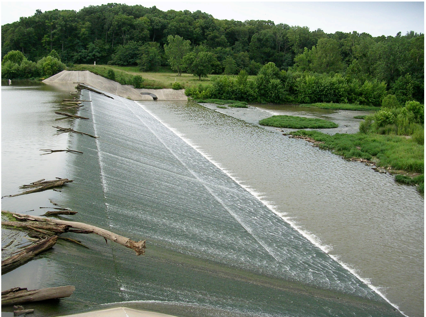
Fig. 4. View of the dam/spillway on the Embarras River in Coles County, Illinois.

Animal Collection. —We collected snakes during 5–16 days between 27 March and 18 September in each of five years (2006–2010). Between one and five experienced observers participated in each day of snake collection. Effort was variable, but was approximately equal between the levee and the dam. We did not correct for capture effort because it could not be precisely quantified across years.