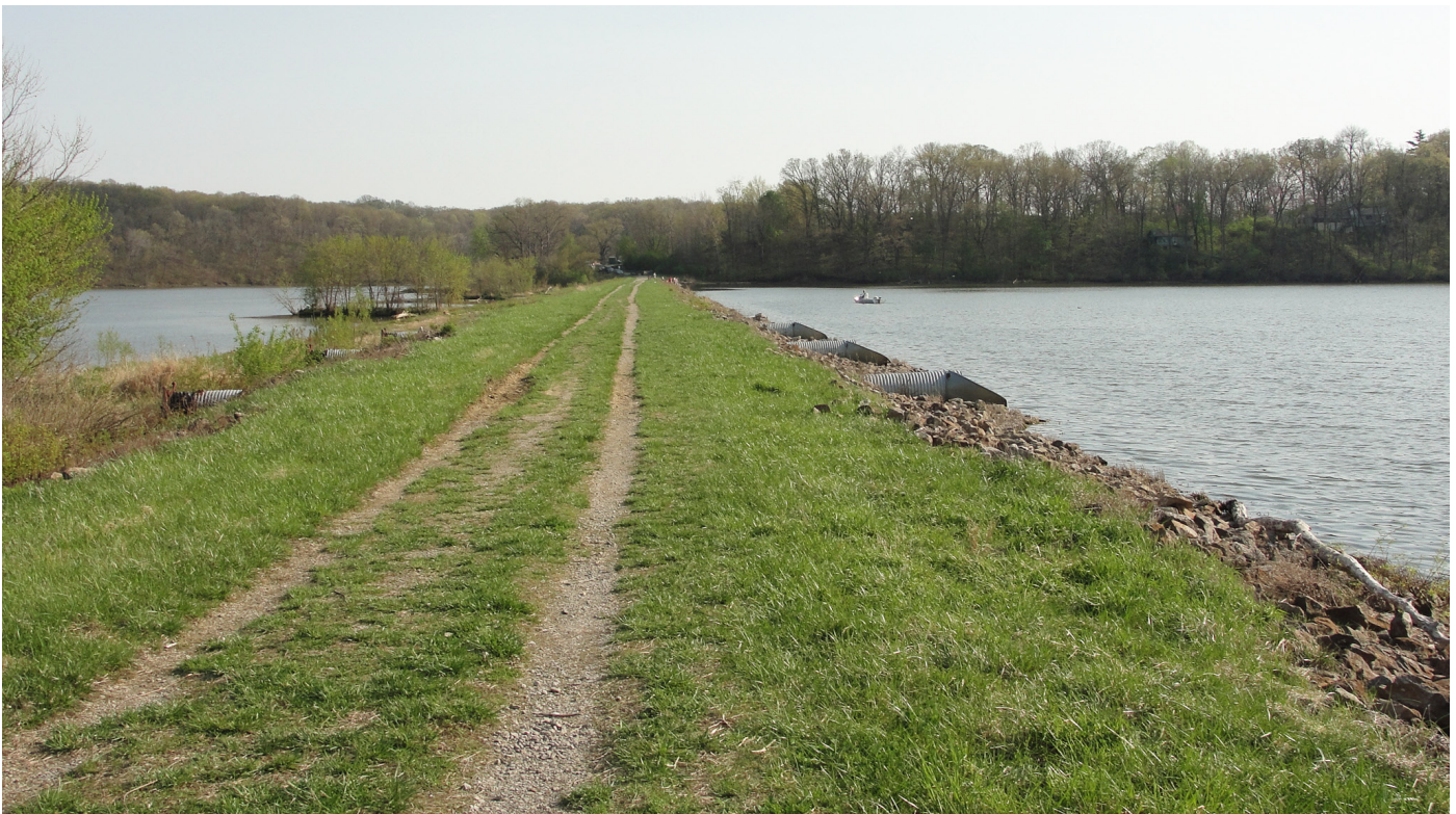
Fig. 3. View of the levee separating the Embarras River and Charleston Side-Channel Reservoir in Coles County, Illinois.

Study Site. —The study site is located at the Charleston Side-Channel Reservoir in Coles County, Illinois, USA (39.464875°N, -88.143871°W; WGS 84), a 142-ha impoundment of the Embarras River. The river flows along a channel and over a low-head dam to the southeast of a levee. Upstream from the dam, water is pumped from the river into the reservoir, which is west of the levee and has negligible flow (Austen et al. 1993). Within this site, we sampled two distinct riparian habitats, the levee (Fig. 3) and the spillway/dam (Fig. 4), that are separated by 180 m of straight-line distance and 260 m of river length. We measured canopy cover at five locations within each habitat using a spherical densiometer.