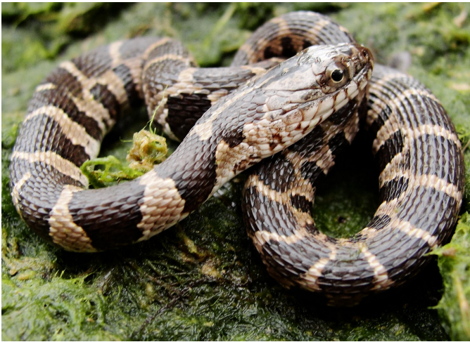
Fig. 2. Juvenile Common Watersnake ( Nerodia sipedon ).

genetic variation in habitat use before making generalizations (Lacy 1995, Savitzky and Burghardt 2000). Habitat use of aquatic juvenile snakes often is difficult to observe, however, because of capture biases (Rodda et al. 2007, Semlitsch and Moran 1984, Todd et al. 2007, Willson et al. 2008) and the size constraints of radio transmitters (Pattishall and Cundall 2008, Roth and Greene 2006, Tiebout and Cary 1987). Recently, researchers have examined juvenile pitviper ecology using advancements in transmitter technology (Cobb et al. 2005, Jellen and Kowalski 2007), yet this type of work still