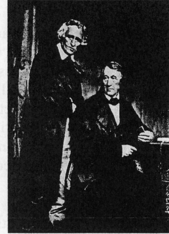
The Brothers Grimm