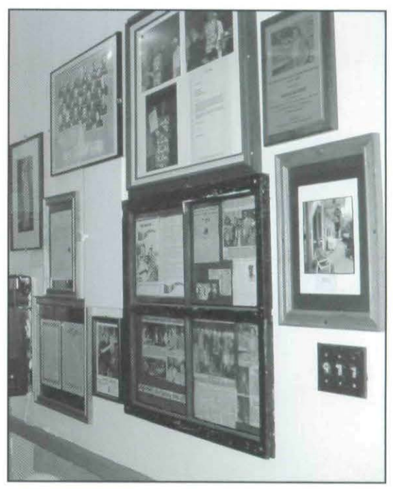
Blues Gallery in First Floor Hallway at Riverside Hotel.