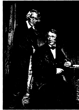
The Brothers Grimm