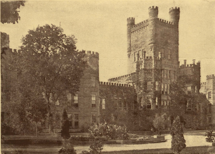
The Eastern Illinois State Normal School, Charleston, Illinois

The Summer Session begins June 21 and ends July 30, 1915