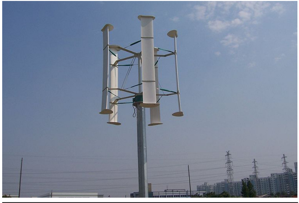
Figure 2: A Modern H-Rotor Darrieus Wind Turbine

Because VAWTs can intake wind from any direction, they can operate in turbulent and variable wind conditions far better than HAWT designs (Berry, 2009). In fact, VAWTs can often operate in higher wind speeds than their HAWT counterparts which equates to greater energy generation under these conditions. These advantages have led both designers and politicians to consider adding VAWTs to urban environments (Ragheb, 2008). VAWTs often have their gearbox and electrical alternator located near the ground which facilitates easier maintenance. Some new VAWT designs have a coefficient of performance approaching 0.40 and allow for greater turbine density per parcel of land (Allan, 2007). Marsh (2005) notes that new H-rotor VAWT designs may also break the 10 MW barrier as the orientation of the blades coupled with modular manufacturing techniques allow VAWTs to be constructed larger than HAWTs. However, there are reasons why VAWTs have not seen more widespread use in wind farms.