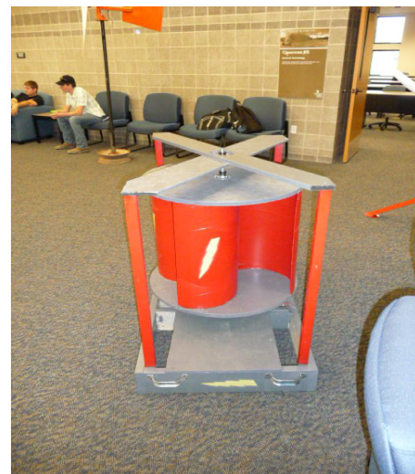
Figure 1: A Homemade Savonius Wind Turbine

generally less than 1. Figure 1 shows a student built Savonius wind turbine.