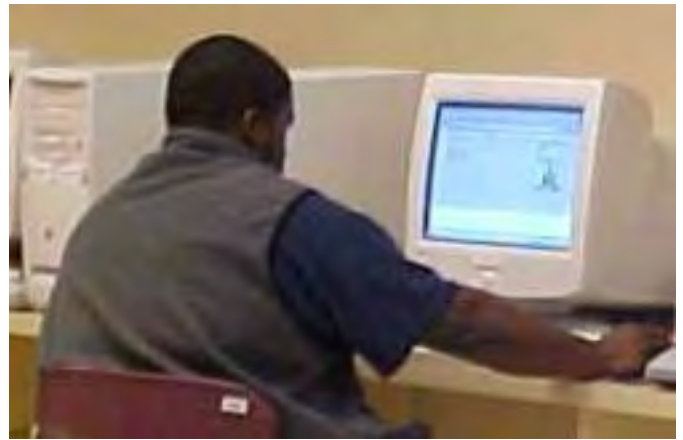
A student works on a PC in the ITC PC Lab