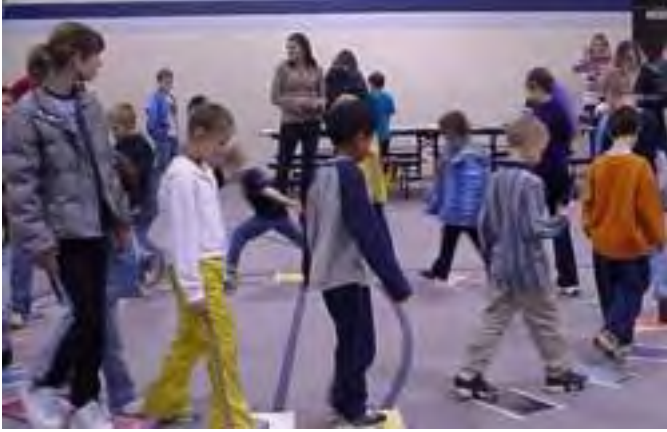
Elementary school students participate in a bookwalk during Family Reading Night at Carl Sandburg School in Charleston.

Students from the Eastern Illinois University Student Reading Council assisted faculty and staff at Carl Sandburg Elementary school in Charleston during "Family Reading Night." The EIU Student Reading Council sponsored the event, which was held the evening of November 21, 2002.