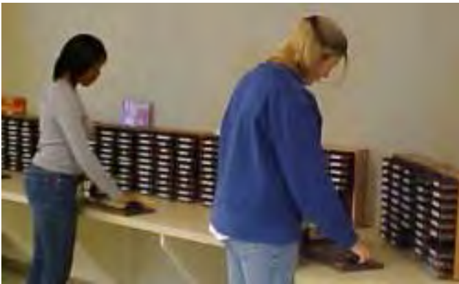
A wide variety of die-pressed materials are available for student use.

The Instructional Technology Center manages checkout equipment and mobile computing equipment for classroom presentations. The ITC has available 5 mobile presentation carts, 7 digital still cameras, 5 mini-DV video cameras, VHS cameras, two mobile Gateway wireless computer carts (16 units each) for faculty checkout.