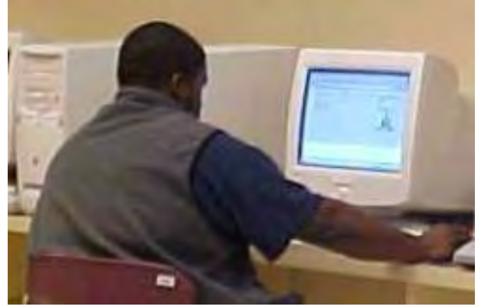
A student works on a PC in the ITC PC Lab

In addition to its services, the ITC provides a facility for students, faculty, and graduates of the programs to and work on high-tech or low-tech projects (ranging from a bulletin board to a multimedia presentation). Individuals who use the facility pay only for the supplies they take with them - such as paper, lamination, or overhead transparencies. The facility provides scissors, glue sticks, markers, and colored pencils for individuals to use. Since the remodeling of Buzzard Building, the ITC has increased the amount of space it has available for students to work on projects for class work.