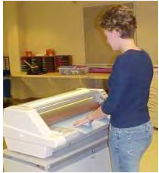
A student utilizes the laminator in the ITC.