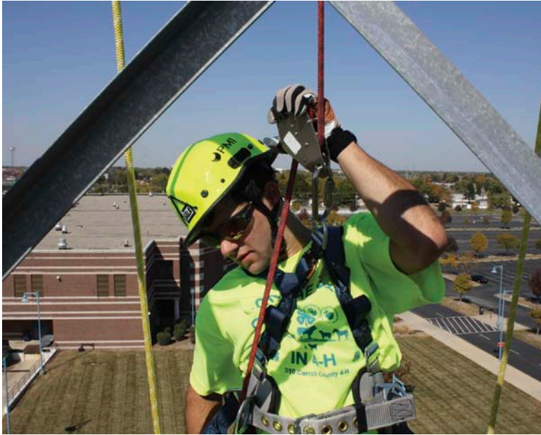
Photo 3: A student performs a controlled descent on the training tower.

evaluation, as functions of higher levels of cognition, can be achieved through exercises and activities. Among others, these can focus on NFPA 70E, JSA worksheets, and climbing and rescue activities. As noted, research shows that hands-on activities increase the effectiveness of cognitive retention (Korwin & Jones, 1990).