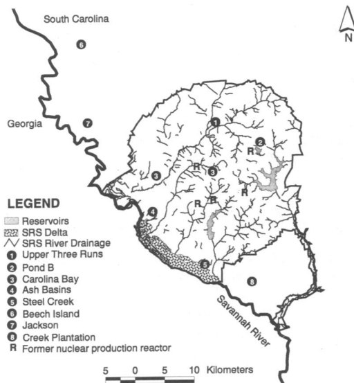
Fig. 1. Map of the U.S. Department of Energy's Savannah River Site showing wetlands and river drainage systems. Capital letters ("R") indicate the locations of former nuclear production reactors, some of which are known to have served as past sources of radiocesium releases (see text).

The first objective of this study was to compare the levels of ^{137}\text{Cs} in the liver and muscle of raccoons living in (1) sites known to be contaminated by ^{137}\text{Cs} on the SRS, (2) SRS sites that had no history of ^{137}\text{Cs} contamination from nuclear activities, and (3) habitats outside of the SRS boundaries. The second objective was to compare ^{137}\text{Cs} levels in raccoons residing in different habitats on the SRS, to include a contaminated reactor cooling reservoir and a contami-