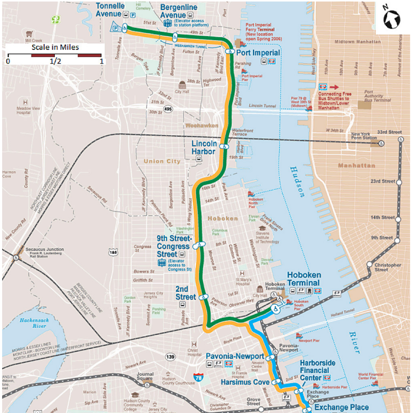
FIGURE 1. The Northern Segment of the HBLRT