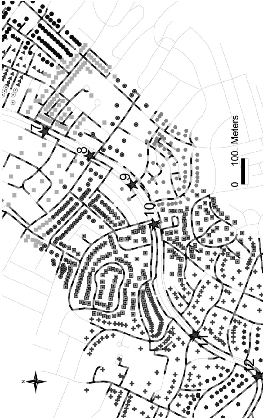
Figure 1. Optimal Walking Paths for Alightings Near Mt. Hood Road (Outbound)