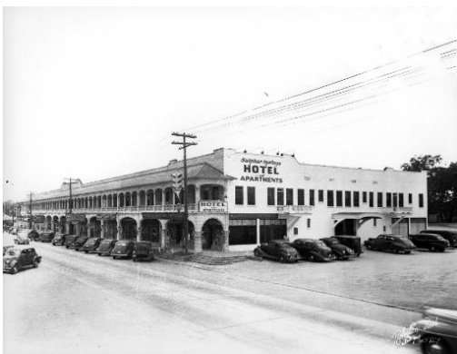
Figure 2. Sulphur Springs Arcade