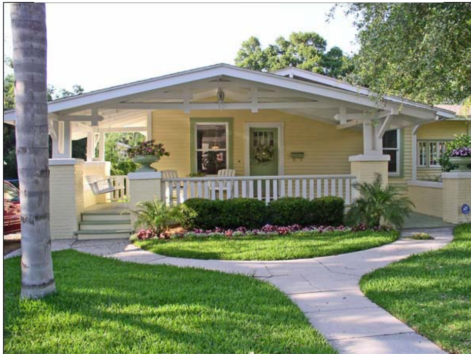
Figure 7. A Bungalow Home in Old Seminole Heights

Heritage and Culture: What is the relationship?