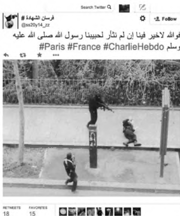
Picture 1. The example of the Tweet regarding the attacks against the Charlie Hebdo magazine

The violent response to the caricatures of the Prophet Mohammad published by the magazine has created an useful religious background for al-Baghdadi’s organization, which tried to provoke French forces and engage them in Syria. Indeed, after the terrorist attacks in January and November 2015, France started airstrikes in Syria (Irish, Vidalon, 2015). It should be also noted that the tragic image of the policemen and the inscriptions affected other, similar tweets that emphasized the sense of revenge and victory over the enemy.