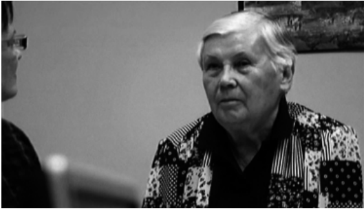
The Lucky Ones , dir. T. Wolski, 2009

to doctors, whose profession as such is unusual, but nonetheless, in documentaries, I have always been attracted by... normality.[3]