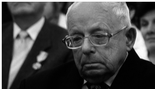
The Lucky Ones , dir. T. Wolski, 2009

of a ward full of newborn babies. Before the camera moves along the metal hospital beds and we see the number of each baby in the foreground, Kieślowski shows the bands with those numbers being fastened to the babies' wrists. The film is consistent in its building two lines of metaphorical associations: the first of a universal nature is about the inevitability of death, the proximity of birth and death; and the second concerns more directly the reality of the People's Poland – where human life was reduced to a number in a system of forced and noxious uniformisation, even in the face of the Supreme.