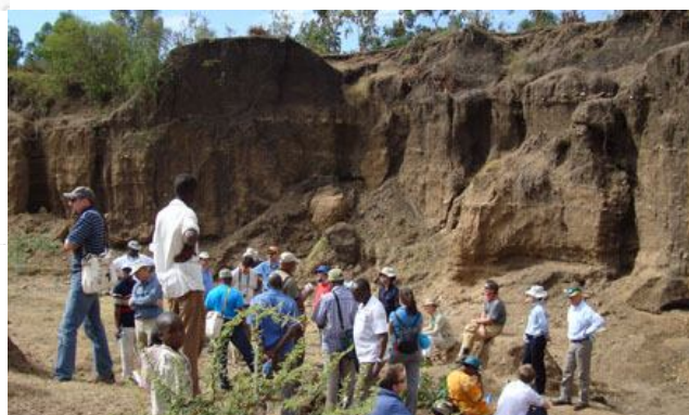
GlobalSoilMap consortium participants on a field trip to Western Kenya