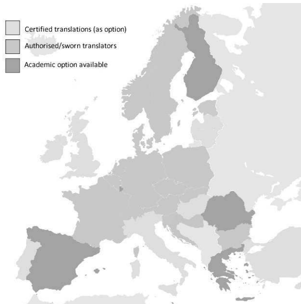
Fig. 1. Geographic distribution of systems for certified translations, state authorised sworn translators and academically authorised sworn translators (Pym et al. 2012, 29).