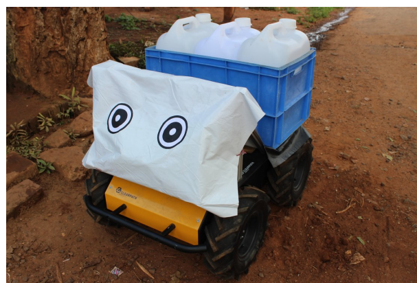
Figure 2: Husky UGV robot fitted with a crate, loaded with cans

It was essential for our research that we use a robotic platform that can carry water in outdoor terrains. We used a mobile robot, the Husky UGV robot from Clearpath robotics [14]. Husky A200 (UGV) is a medium sized robotic development platform which can carry a payload upto 75 kg. A crate was attached on top of the robot to place water cans in it, refer figure 2. At a time, 3 water cans can be loaded on the robot and each can has a water holding capacity of 20 litres. This enabled the robot to carry upto 60 litres in one trip. The robot was also equipped with a bluetooth speaker and text-to-speech (TTS) capability [15] which was used to give instructions to users in their local language (Tamil) using a synthetic male voice. The robot was tele-operated by a researcher during the study for navigating it around and also to trigger the TTS. The participants were made aware that the robot is tele-operated. The tele-operator was placed roughly 10 meters behind the robot.