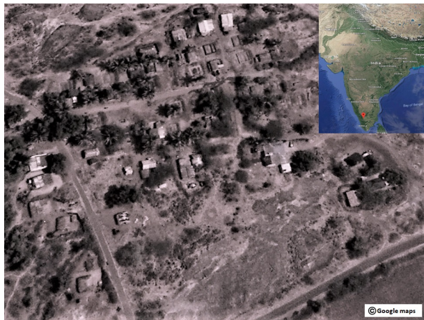
Figure 1: Satellite image of Ayyampathy Village in India

The study was conducted in a rural village called Ayyampathy near Coimbatore in the southern Indian state of Tamil Nadu (figure 1). The village consisted of 25 houses with approximately 200 inhabitants. The study was conducted in November 2017 when the water availability from the nearby water tank (which is the main source of water supply in the village) is moderate during this time of the year. The water tank was at a distance of roughly 100 to 500 meters from the houses depending on how far the house was located.