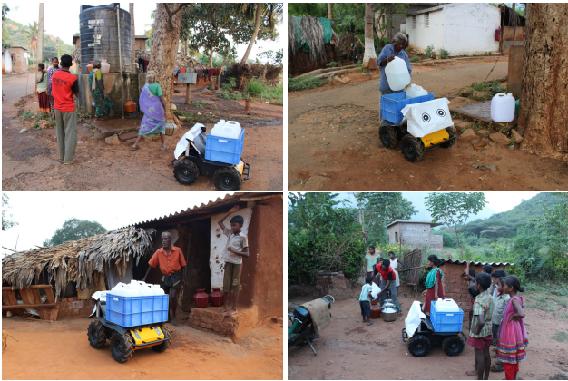
Figure 3: Husky robot helping the participants

The participant was interviewed after the task and their response recorded using the post-questionnaire [12, 13] and also in form of audio recordings. Each participant took about 45 minutes to complete the study including questionnaires.