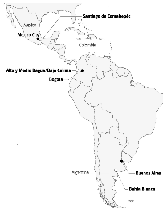
Fig. 1. The location of the three cases in which the scenario-planning method was implemented. More information about these cases is available in Table 1 and online ( http://www.comet-la.eu ).

Our method contained 4 stages (Fig. 2). The first stage of the method explored how drivers of change could affect the system. Each team preselected drivers for presentation to the community by reviewing the drivers identified by a regional scenario-planning exercise for Latin America (The Millennium Project 2010) and selected 5 drivers to fit with the so-called STEEP typology, i.e., social, technological, environmental, economic, and policy (Bradfield et al. 2005). The selection was also informed by the teams’ prior knowledge of the case system. The teams then specified 2 possible states for each driver, e.g., population may decline by 10%, or increase by 10%, informed by the latest statistics and trends reported for each country. This step was based on the literature because relying only on local perceptions to identify drivers may risk missing important drivers of change (e.g., Enfors et al. 2008). However, the drivers and their contrasting states were presented to the communities to modify or reselect.