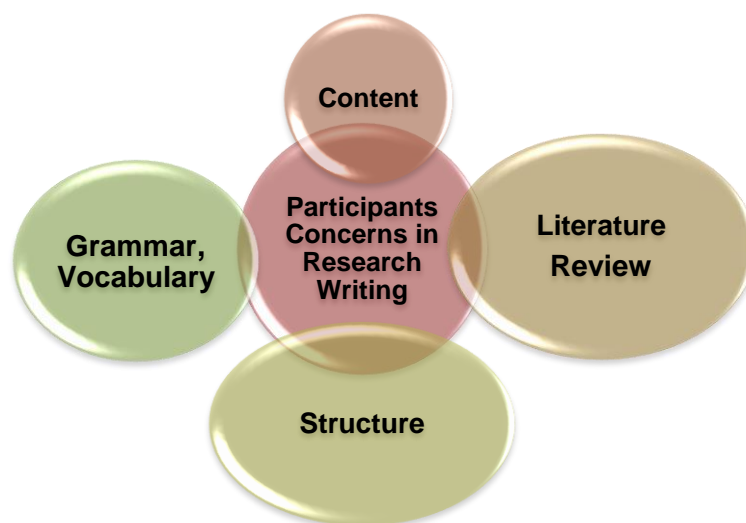
Figure 1.3 Participants' concerns in academic writing

Clear distinction about different forms of academic writing was evident in the participants. Since the participants were from engineering and computer science disciplines, they preferred writing technical reports, as required by their industrial partners, as it provided them with specificity in the tasks. Participants also remarked that a technical report is an easier way of conveying ideas or information, using technical data and diagrams, whereas the thesis format seemed ‘scary’ with the more complex structuring of the content. In general, the participants had concerns over grammar, topic, context and structure associated with academic writing, with specific concerns about vocabulary (e.g. paraphrasing), and the literature review.