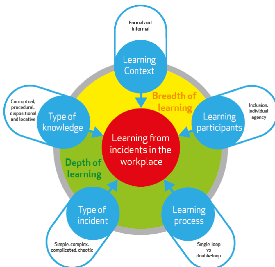
Figure 2. The LFI Framework (Lukic et al., 2012a)

These two perspectives, the temporal and sequential learning phases of the LFI Process Model and the underpinning learning components of the LFI Framework, function together in an effective LFI process.