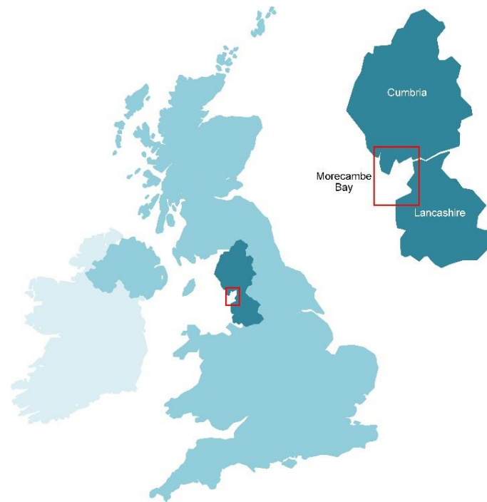
Figure 2. Case study area (Morecambe Bay, UK)

The bay dominates local history, the natural environment, landscape and, arguably, offers the most distinctive element to the visitor experience. The bay is not only a vista but provides specific elements of the experience such as beaches, wildlife/nature reserves, fishing, local produce and even the renowned cross-bay walks with The Queens Guide to the Sands. Thus, Morecambe Bay is a famously dynamic natural environment, which is distinct and seems likely to inform the tourist experience through the products, activities, and vistas it offers. Indeed, the regional tourist board responsible for the southern part of Morecambe Bay describe it as ‘a place with unique wildlife and habitats and a great place for outdoor adventures’. Their website promotes the destination in terms of walking, cycling and ‘wildlife adventures’, boasting of ‘nature’s amphitheatre’ (Visit Lancashire, 2017). Evidently, the bay offers the potential of a clear destination identity for this area in terms of tourism marketing.