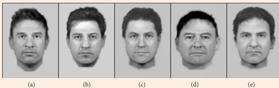
Figure 2: Example composites of actor Karl Munro constructed by condition:

Design: Composite likeness ratings was a within-subjects' design, with further participants rating both upper and lower halves of composites constructed from all five conditions.