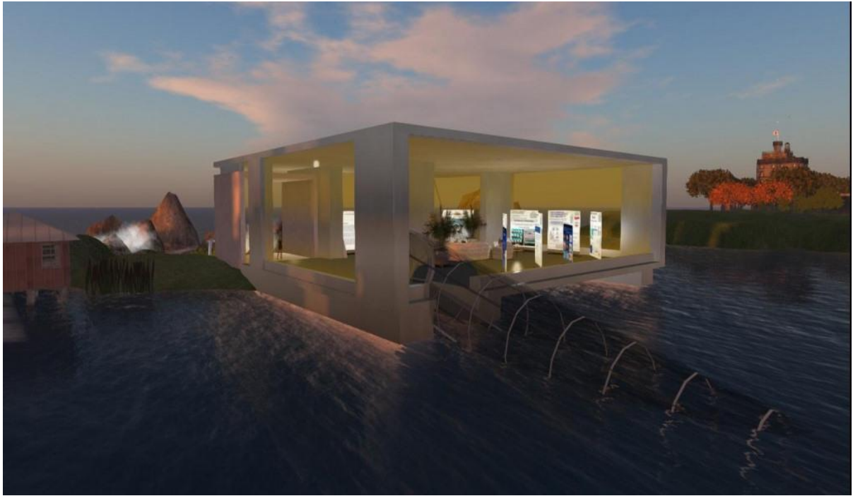
Figure 3: Tunnel to the Underwater Level