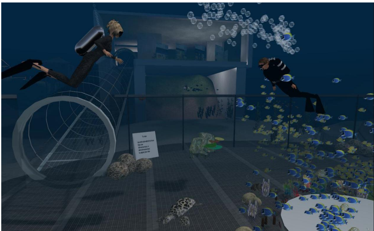
Figure 4: View within the Underwater Level