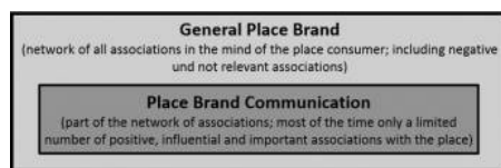
Figure 1. Difference between place brand and place brand communication