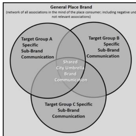
Figure 3. The city branded house strategy

Central in our strategy are traditional place brand communications as well as other means of city communication (i.e. physical place communication and place word-of-mouth), as these jointly build perceptions about the city brand in the mind of the city customers. While the traditional place (brand) communication can be (mostly) controlled by the city marketers and urban policy-makers, it is important to keep in mind that they could also show unintended communication effects, as a city's resident will, for example, also be affected to some extent by communication intended for tourists (so-called waste circulation ). Additionally, sometimes, city customers fulfil different roles at the same time (e.g. to be a resident and an investor), and multiple sub-brand foci could be addressed to one individual. This is a challenge for managing the City Branded House Strategy , as the sub-brands cannot be seen as independent brands, but also may influence each other through the waste