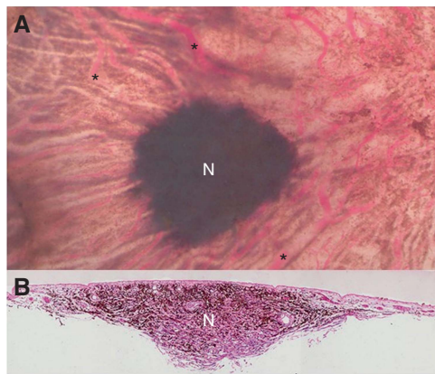
Figure 1. Clinical and histopathological manifestation of a choroidal nevus. (A) Choroidal nevus (N) (72 year old, female). Retina and RPE removed; choroidal vessels visible (asterisk). Size ~4 mm diameter. (B) Section through nevus showed thickened area of pigmented nevus cells and large blood vessels at the lesion's edge (arrows) (periodic acid-Schiff stain).

In this study, we analysed the frequency of GNAQ/11 mutations in choroidal nevi and analysed YAP activation as a possible downstream effect.