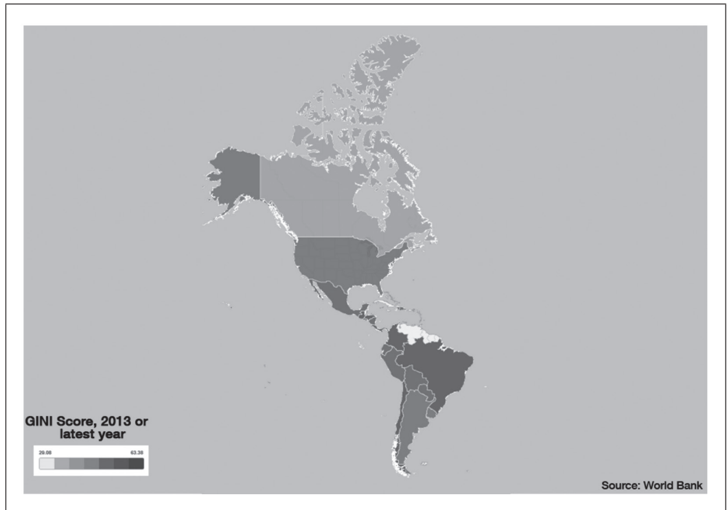
Figure 2 Inequality in America in 2013 using the GINI index (on income) as a measure of inequality for each country 7