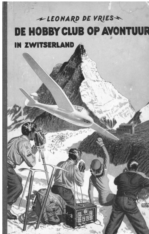
Figure 3. Cover of Leonard de Vries’ The Hobby Club’s Adventures in Switzerland , 1949 edition (first edition: 1948).

Just like the Evolution omitted the huge contribution of electronics to the war machine that could destroy all life on the planet, so De Vries remained mostly silent on the threatening aspects of modern technologies, emphasizing their life-enhancing qualities. Reading his books, one senses that one is in an atmosphere of extremes, but one only hears the somewhat