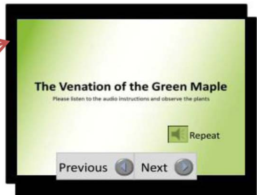
(b) STP condition