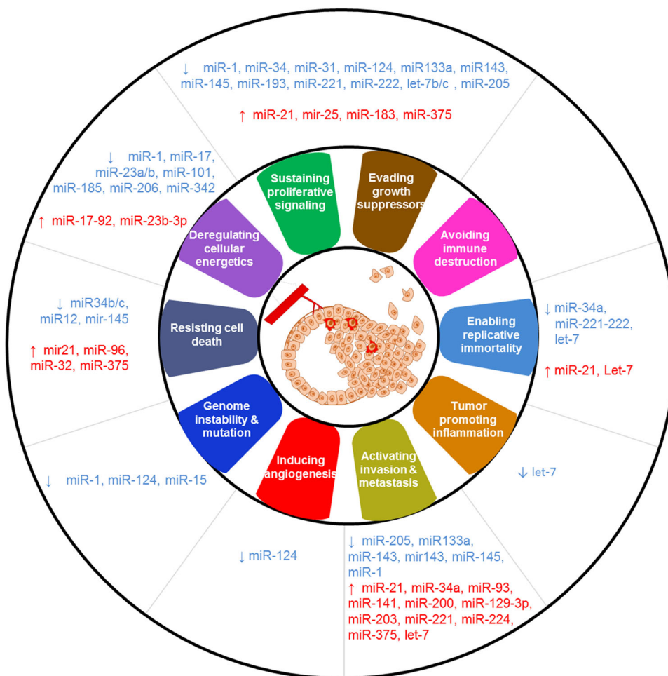
Fig. 1 Many dysregulated microRNAs (miRNAs) affect the hallmarks of prostate cancer [70, 140, 158–160]

heterogeneity of a miRNA sequence length can arise from imprecise processing by endoribonucleases Dicer or Drosha [75]; by enzymatic post-transcriptional modifications, for example, by exoribonucleases (Nibbler and QUP); or by terminal uridylyl transferases (TUTs) and poly(A) polymerases (PAPs) [76]. Variations in miRNA sequences can be introduced via post-transcriptional editing by enzymes such as the ADAR proteins [77]. In breast cancer, isomiRs were found to be differentially expressed between healthy and cancer tissues, and were able to discriminate between different breast cancer subtypes [78, 79]. IsomiRs are not randomly distributed within tissues but are expressed in patterns that are more complex than initially thought [78]. IsomiRs can also be detected in both blood and urine [80]. In urinary extracellular vesicles (EVs) from patients with PCa, many isomiRs are differentially expressed between cancer samples and age-matched controls. Importantly, in accordance with findings in breast cancer, prostate tumors that exhibit deregulated expression of an miRNA simultaneously exhibit deregulated expression of isomiRs, which are derived from the same miRNA precursor. This has been demonstrated in