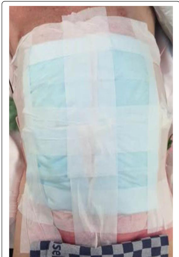
Fig. 2 Abdominal dressing used to blind the patient for the type of distal pancreatectomy

Patients will be blinded using a large (30 × 30 cm) abdominal dressing, which is administered in the operating room immediately after the operation (Fig. 2). Patients are blinded until functional recovery has been reached or at least up to day 5 postoperatively. Earlier removal of the dressing is allowed for urgent medical reasons. Previous trials in The Netherlands have found this approach feasible [8, 31]. Full blinding of medical and nursing