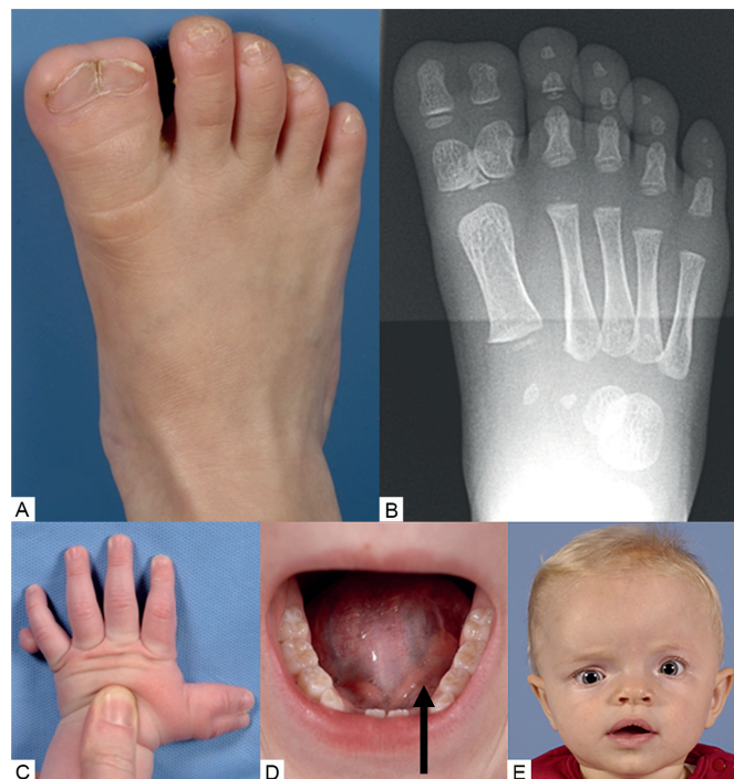
Figure 2. Example of preaxial polydactyly of the foot and some related phenotypes.

22 patients never received a genetic test or test results were not documented. In 5 of the 6 patients with unilateral PPD